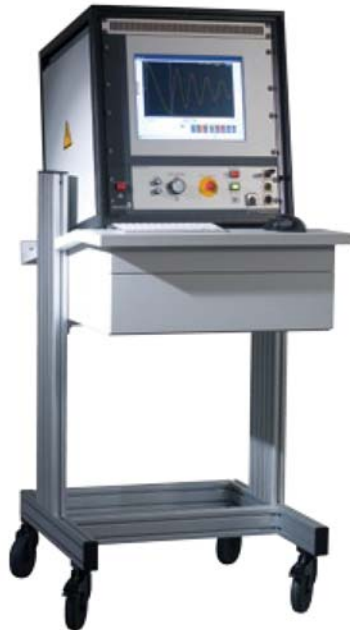
rolling table with diagonal work plate and drawer element