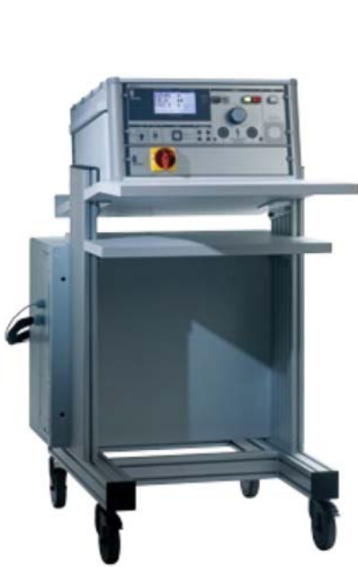
rolling table with diagonal work plate and integrated high-voltage test