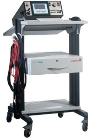
rolling table with diagonal work plate, drawer element and cable holders