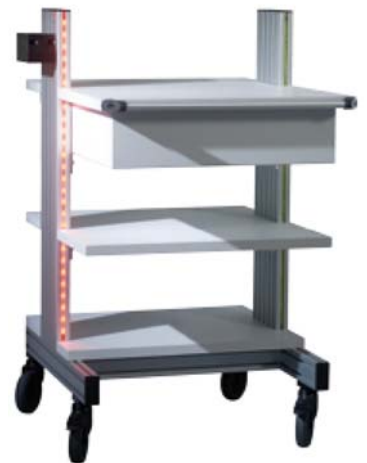
rolling table with horizontal work plate, push handle and a LED warning light integrated in the bars