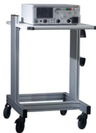
rolling table with horizontal work plate and push handle

The rolling tables can additionally be equipped with self-closing drawer runners, in which e.g. adaptors, tools, or documentations can be stored.