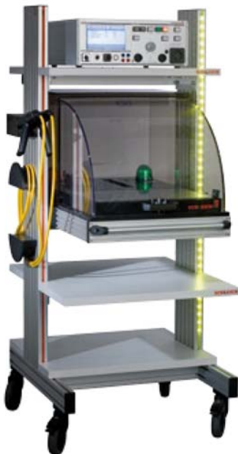
rolling table with integrated test cover, push handle, LED-warning light in the bars and holders for cables, test pistols, and test probes