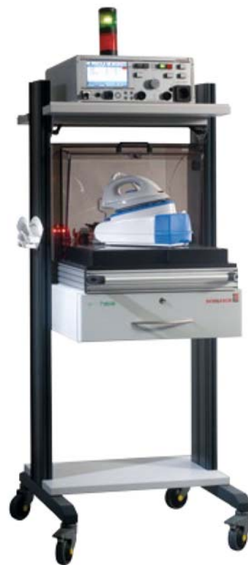
rolling table with integrated test cover, drawer element and cable holders